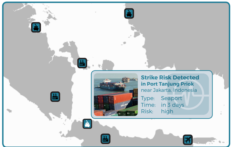
Dynamic map of labor strike alerts

Access Prewave data and improve your strike awareness: